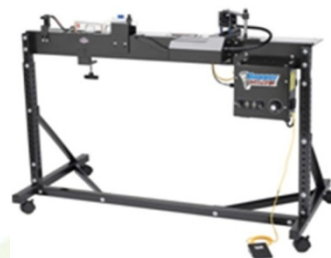
Cyclone Banner Hemming system

Stop sending your banners out to be hemmed, and forget sewing or heat-sealing hems in your shop. The Cyclone installs double-sided banner tape into hems fast. And, your banner hems will be neat and perfectly straight with no stitch lines—every time! Best of all, you will recoup your investment is a year or less. To view a video demonstration of the Cyclone, visit www.usbanner.com .